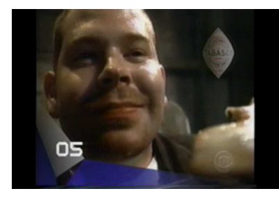
(b) new Prioritization Scheme