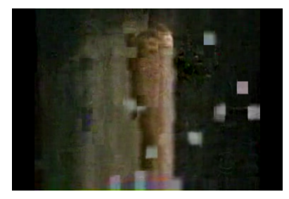
(a) Legacy 802.11e